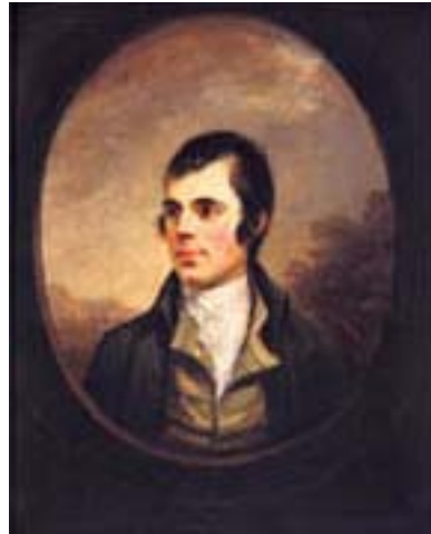
Robert Burns, by Alexander Nasmyth

1787 Another remarkable year for Robert: He visits Edinburgh, where the Edinburgh Edition of his Poems is published, and Robert himself is lionized by the Edinburgh literati ; Henry MacKenzie (whose opinion is law among the literati ) writes his review of Robert's Poems for The Lounger , in the review MacKenzie states "this Heaven-taught ploughman" who, despite "the lowness of his birth" was a genius of the no ordinary rank; Robert takes lengthy tours of the Borders and the Highlands; confined to Edinburgh because of a knee injury, Robert engages in a letter romance with Agnes "Nancy" McLehose (Clarinda).