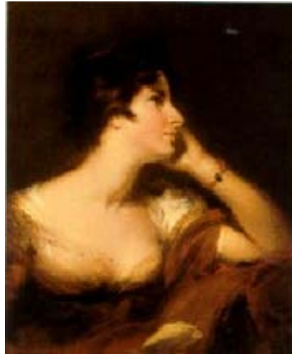
Maria Riddell, by Sir Thomas Lawrence

Burns was active and creative almost until the day he died, composing about 300 lyrics in the last 10 years of his life